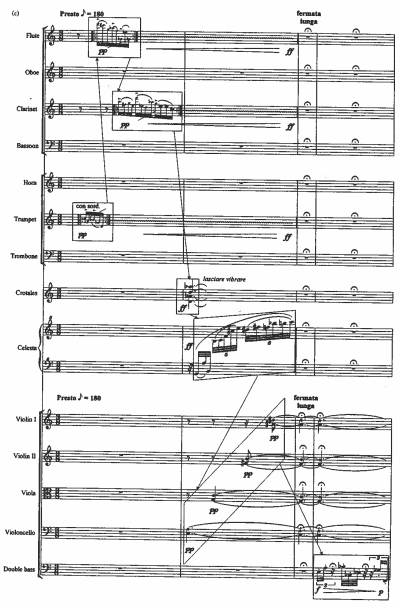
Figure 5. Peter Maxwell Davies, A mirror of whitening light.