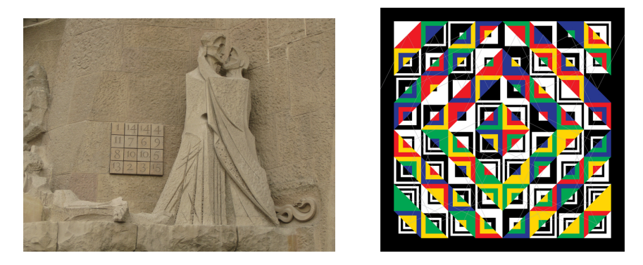
Figure : The pseduo-magic square on the front of Gaudí's Sagrada Família (left; rows, columns, and diagonals sum to 33), and Magic Square 8 Study: A Breeze over Gwalior (right), a work based on an 8 \times 8 magic square by mathematically-inspired artist Margaret Kepner.