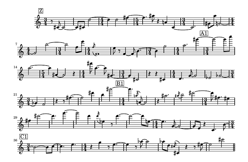
Figure : The flute part starting at rehearsal letter Z in A Mirror of Whitening Light. The notes are obtained from the magic square by spiraling around the square in the counterclockwise direction.